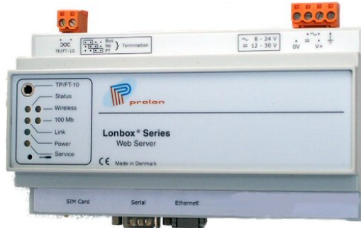
Figure 2 PFG4000 Picture

The PFG4000 is mounted in a plastic 9 module gray DIN-rail enclosure M36.